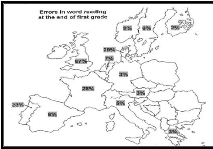
Figure 2. Variations in Early-childhood Literacy Achievement in Europe (Excerpted from: Dehaene, 2009, 'Reading in the Brain')

a learning task than in relatively “opaque” languages such as English.